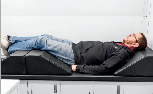
3-in-1 Exam Bed Cushion Set