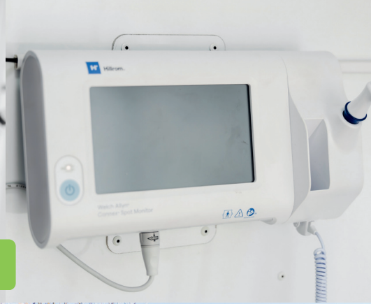
Welch-Allyn Diagnostic System